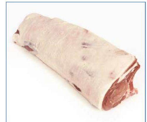
7 Loin of Pork – bone-in, rindless, excluding fillet.