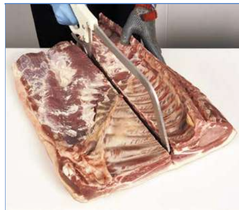
5 ... and by following the back line of the carcass towards the lumbar section of the loin.