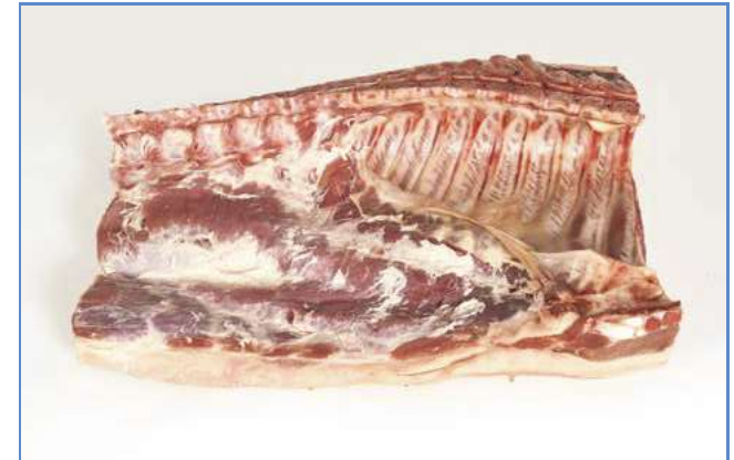
3 Middle of pork.