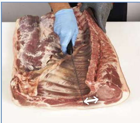
4 The belly is removed from the loin, 50 mm from the tip of the eye muscle ...