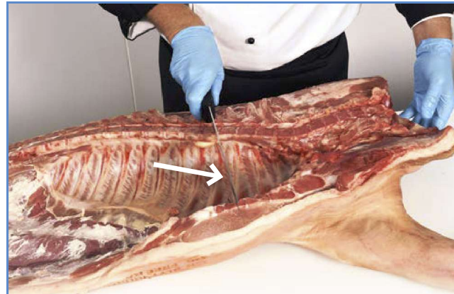
2 Make a mark in the centre of the 4th and 5th rib counting from the neck down and in the centre of the 5th thoracic vertebrae draw a straight line. Saw and cut following this line to remove the forequarter.