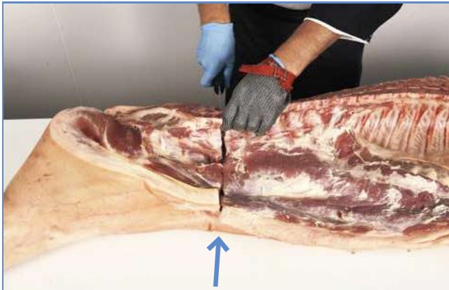
1 After the removal of the fillet, the leg and chump is removed between the 5th and 6th (last two) lumbar vertebrae