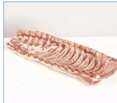
6 The rind is removed from the loin. Maximum, fat level 10 mm.